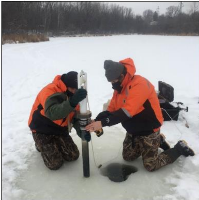
Sediment cores were collected from the ponds in January 2021. The cores will be used to determine the levels of phosphorus in the sediment at the bottoms of the ponds.