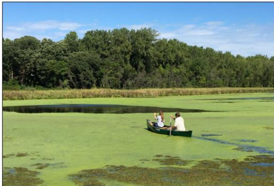
Staff surveying water quality at South Rice Pond in September 2020.

The assessment began in spring of 2020 and will continue through 2021.